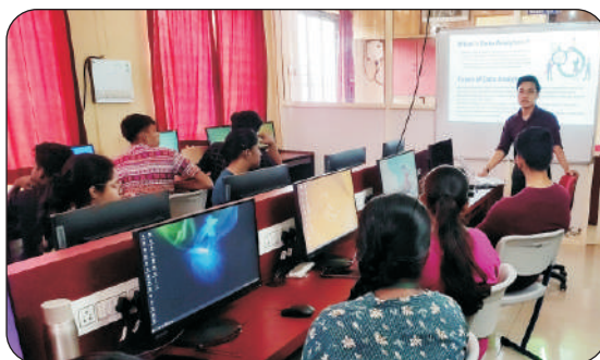
Workshop on Data Analytics using Google Collab