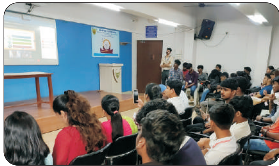
Workshop on Incubation Start-up for Students and Teachers