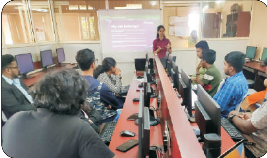
Workshop on Bootstrap

For professional interaction we invite industry experts/professionals to deliver workshops, talks, organize industrial visits to keep our students abreast of latest trends in IT .