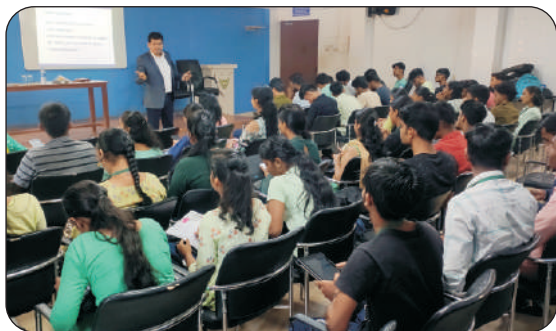
Seminar - Motivational Session by Successful Entrepreneur