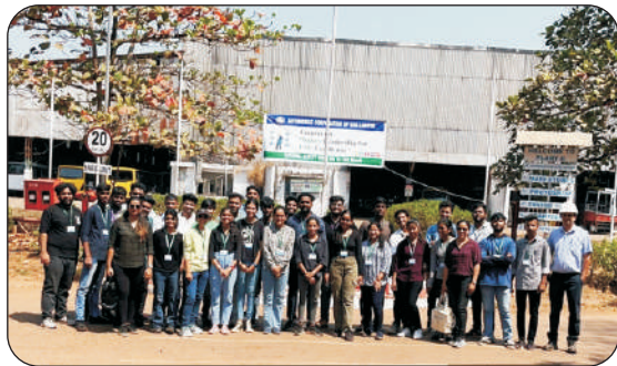
Industrial visit to A.G.C.L.