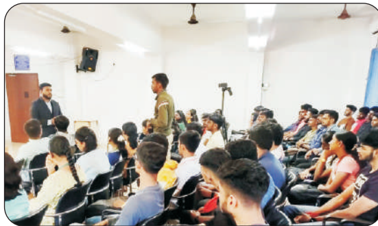
Workshop on Cyber Security