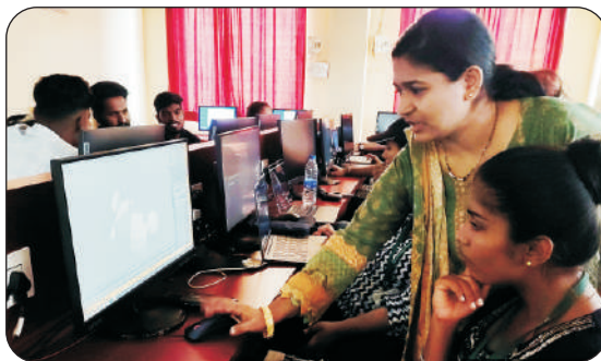
Workshop on 3D Modelling and Animations