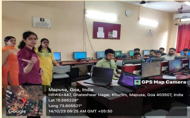
Hands on Bootstrap workshop was organised by BCA Department