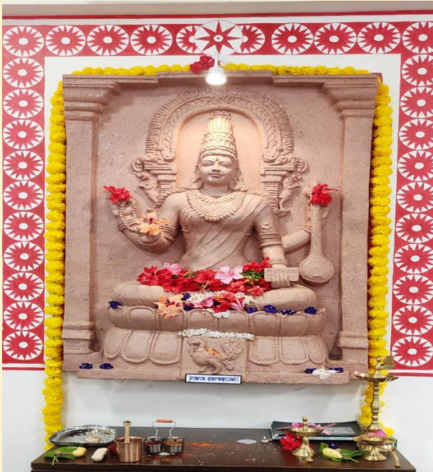
The Arts Faculty Worships Jnana Saraswati