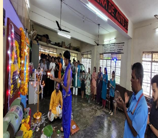
The Vocational Stream celebrated Navami shastra Pooja in Automobile Engineering Technology section' workshop.