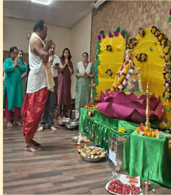
Saraswati Pooja was conducted by the teachers and the students of PWSSS.