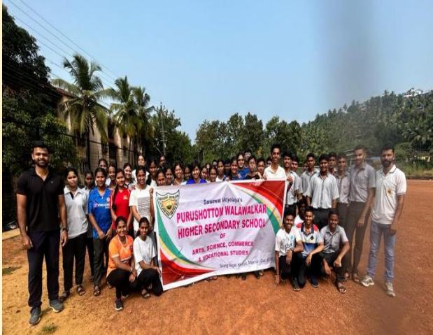
RUN FOR UNITY to celebrate the Birth Anniversary of Sardar Vallabhbhai Patel.