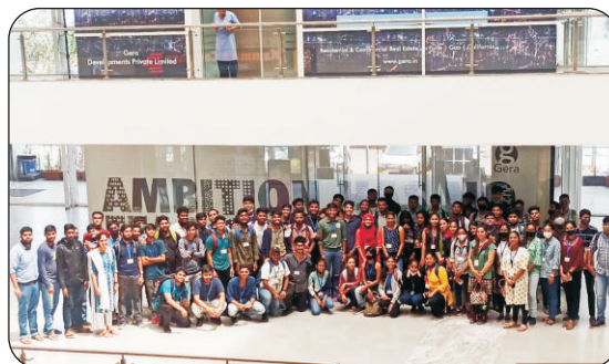
Industrial visit at Tangentia-India