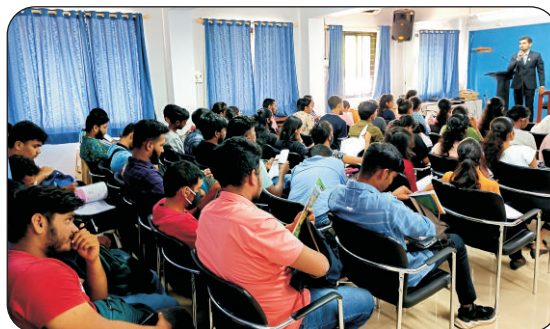
Workshop on Problem Solving and Reasoning Skills