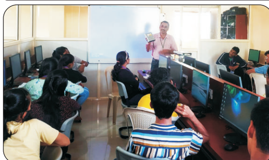
Workshop on Computer Hardware and Networking