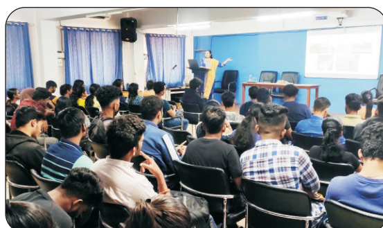
Guest Lecture on Significance of Ocean & Marine Microbes to the Society