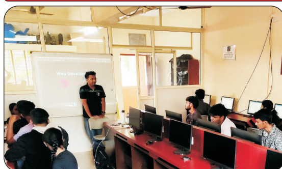
Workshop - Hands on Full Stack Web Development