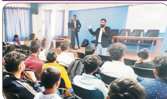
Workshop on Cyber Security