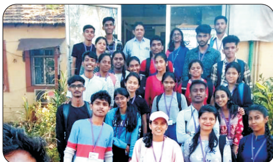
Industrial visit at GWAVE

For professional interaction we invite industry experts/professionals to deliver workshops, talks, organize industrial visits to keep our students abreast of latest trends in IT .