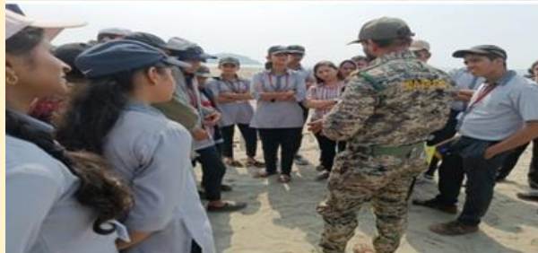
Marine Rescuer explaining about the Olive Ridley turtle 🐢 behaviour and nesting habit.